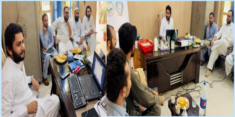
ToT Capacity Building Session over Safe Handling of Pesticides and Disease Identification for Newly Recruited Agriculture Officers under ICT Agriculture Transformation Plan organized by the Department of Agriculture Extension, Bannu.