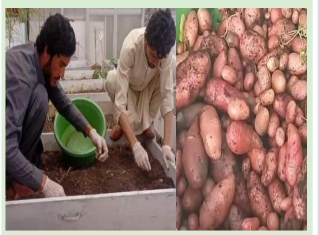
Harvesting of Virus Free Seed Potatoes in green house at ARS, Parachinar under AIP-Scheme "Virus Free Seed Potato Production using Tissue Culture Technology at higher altitudes of Kurram and Orakzai".